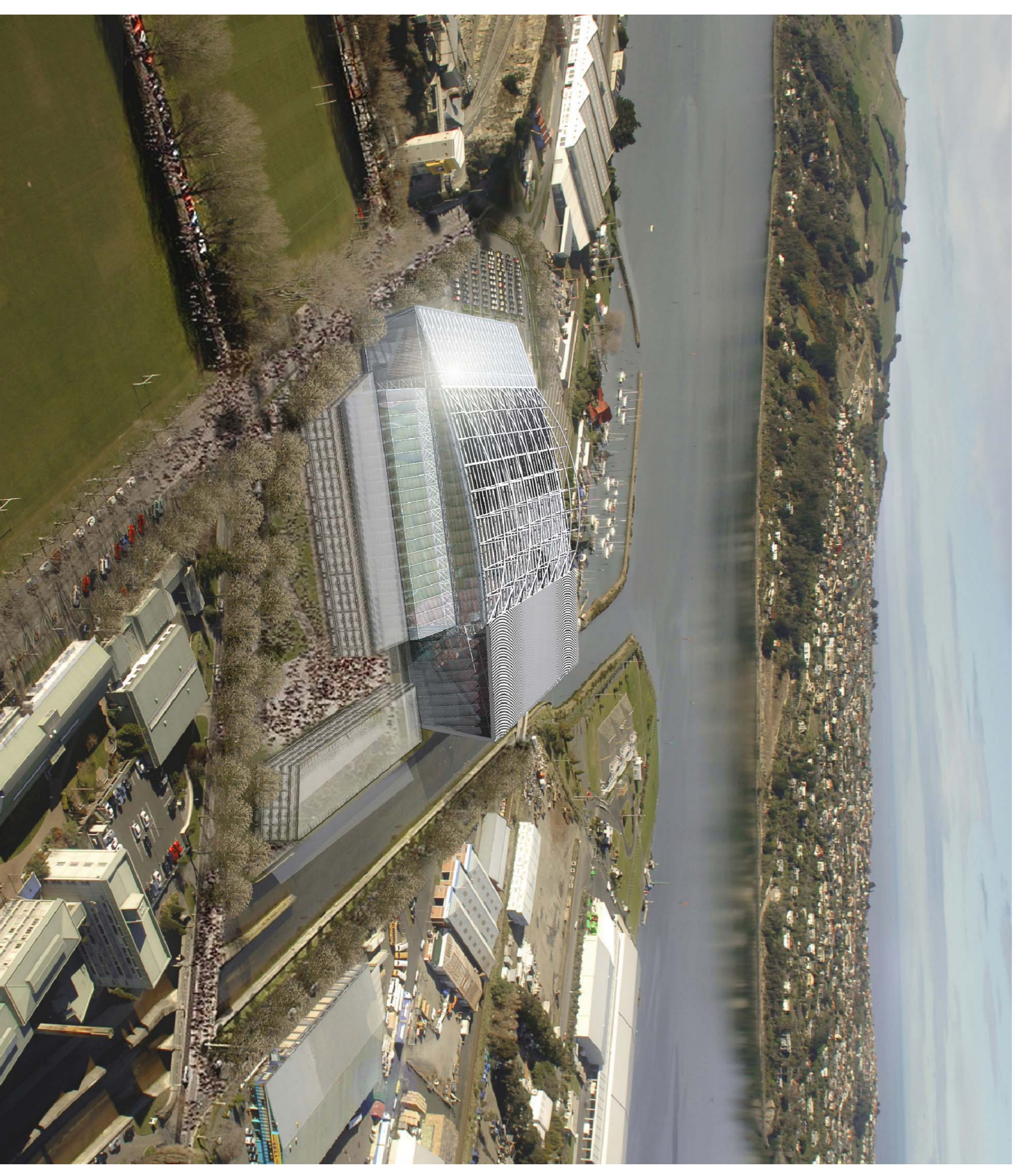
Tied-Arch Truss Option