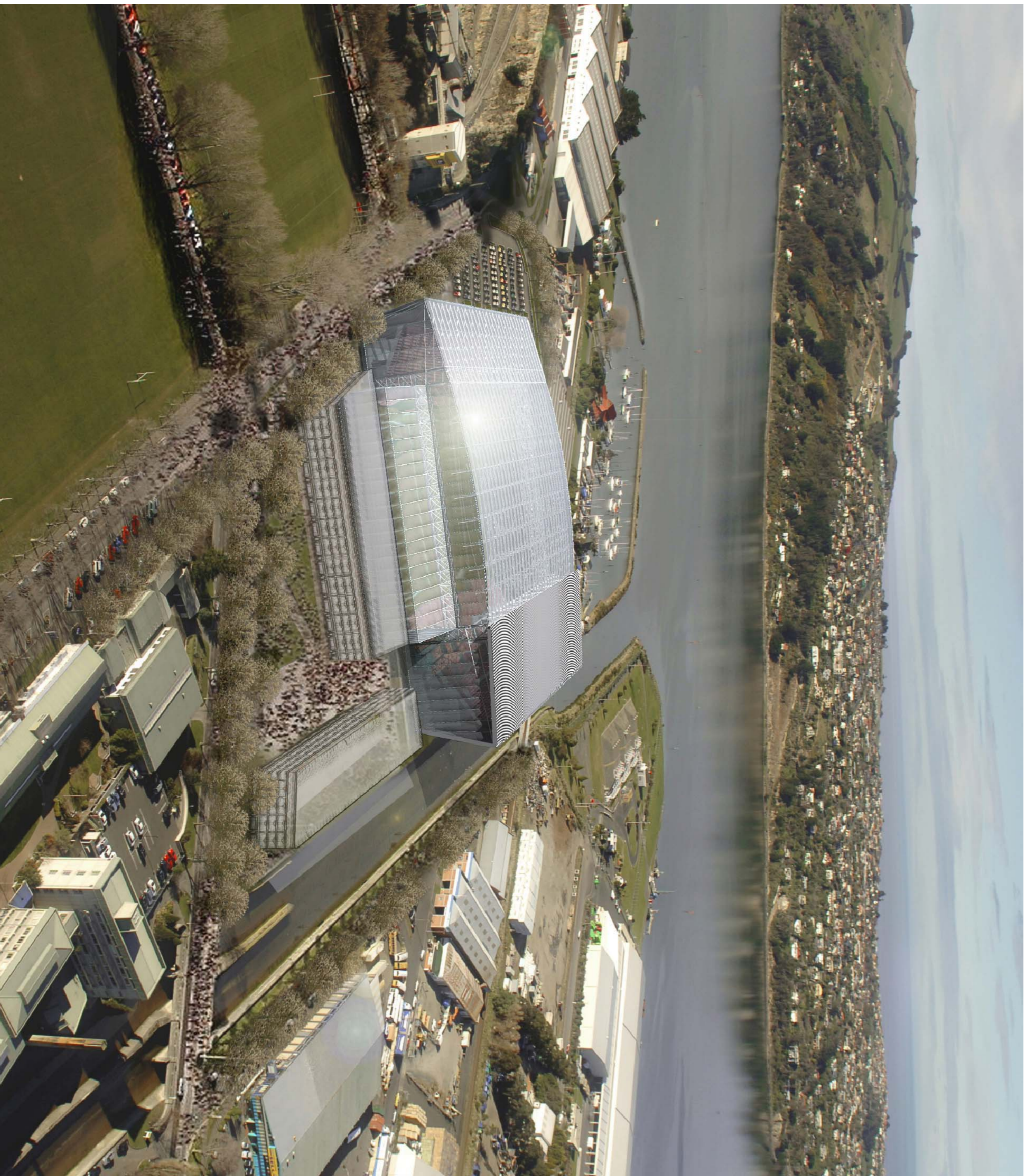
Lensse Truss Option