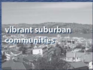
vibrant suburban communities