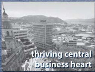
thriving central business heart