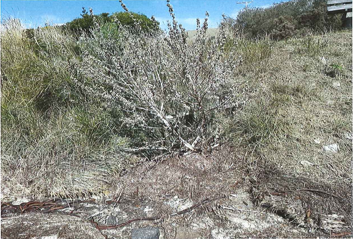
Stepney Ave Harwood 60-70 Stepney Ave