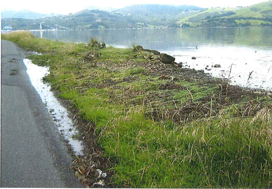
Stepney Ave flooding 2014- ongoing issues