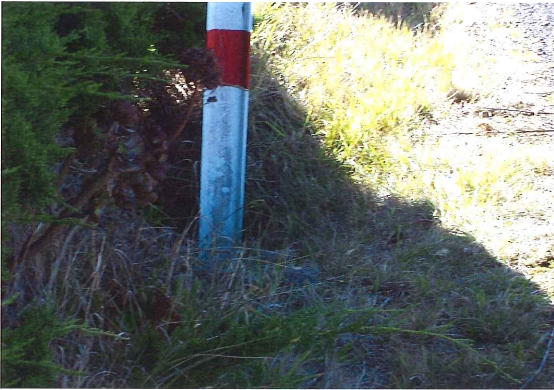
Sunken road marker 16 Micheal Ave. Roadside