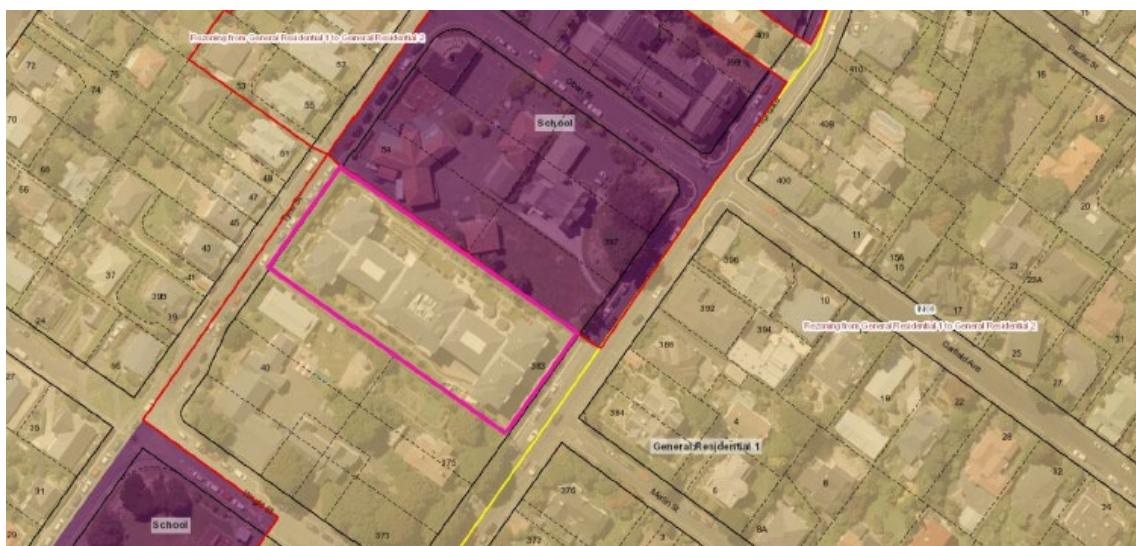
Figure 2 – 383 Highgate outlined in pink (Yvette Williams Retirement Village). Red line indicates border of IN08 rezoning.