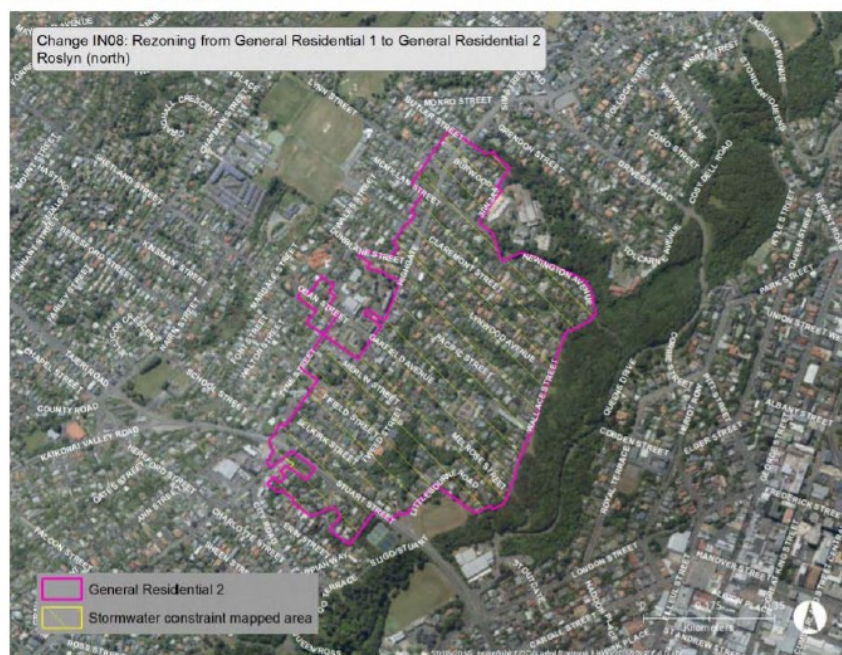
Figure 1 – Change IN08 rezoning, outlined in pink.