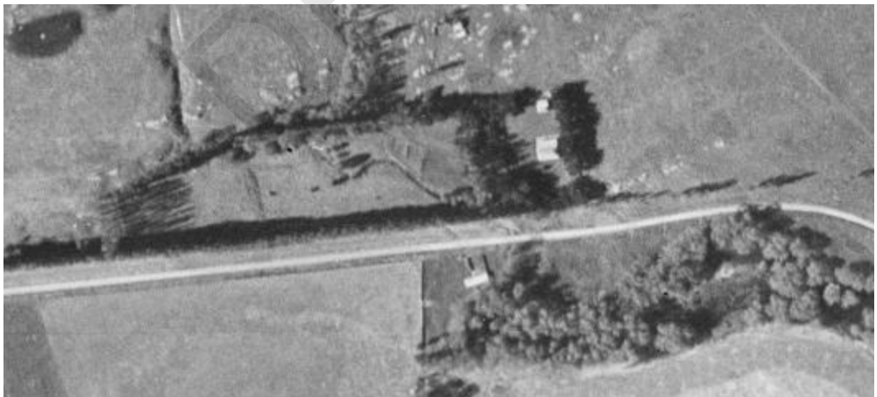
Date taken: 9/04/1945 (LINZ CC-BY 3.0)