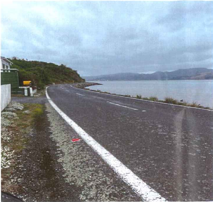
Image 2 - the road near Otakou. Note the narrow carriageway, no verges, no footpath/cycleway, the drop straight into the harbour from the vehicle carriageway, and the carriageway has not been raised to mitigate flooding adjacent to the harbour.