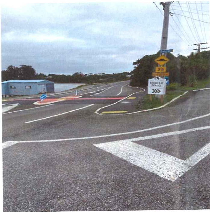
Photo 1 - Road heading through Broad Bay. Note in particular the new raised crossing point, footpath on both sides, the new shared cycleway/footpath on the harbour side, wide smooth carriageway and verges.