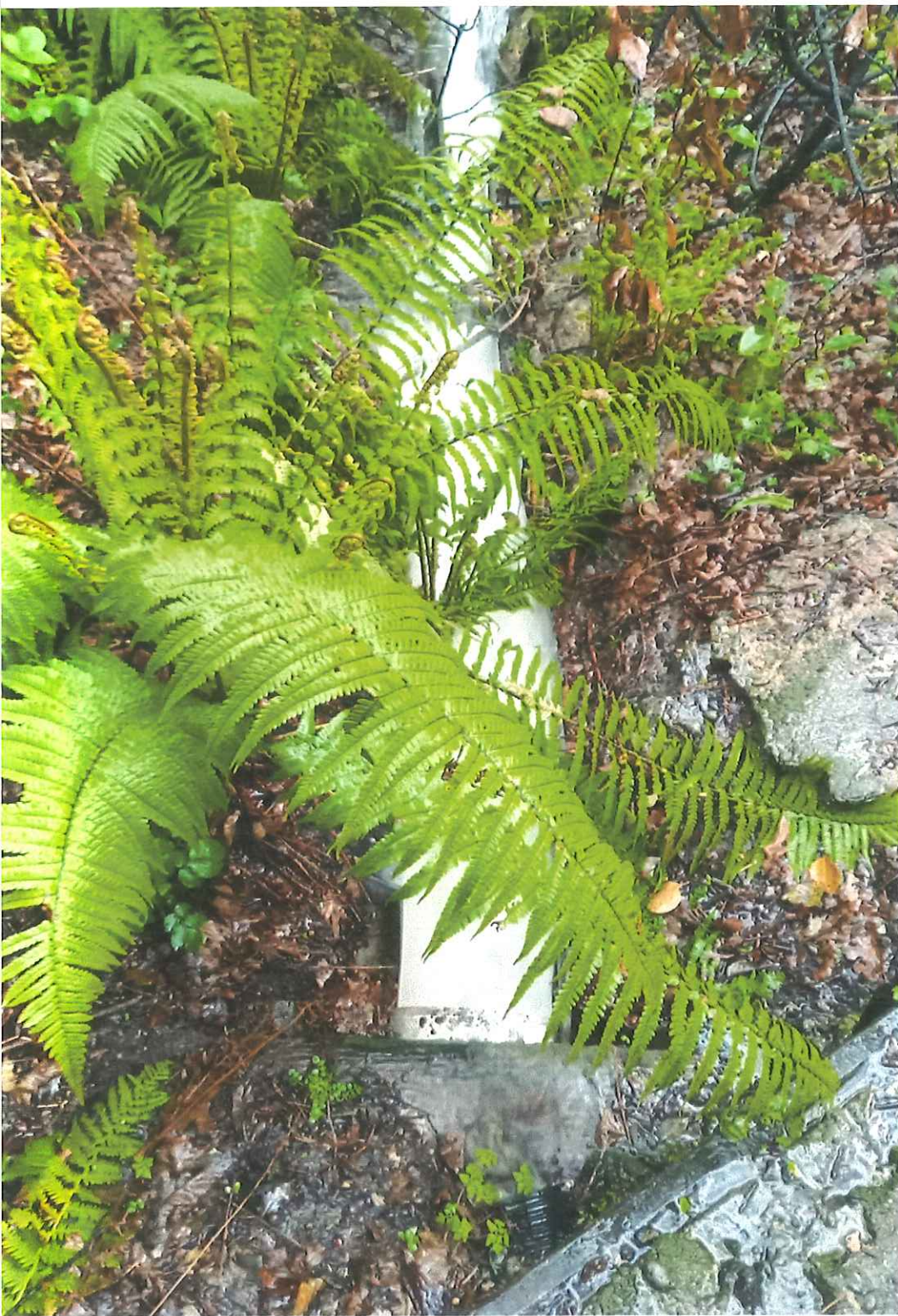
end of 225 mm pipe during early Oct rainstorm.