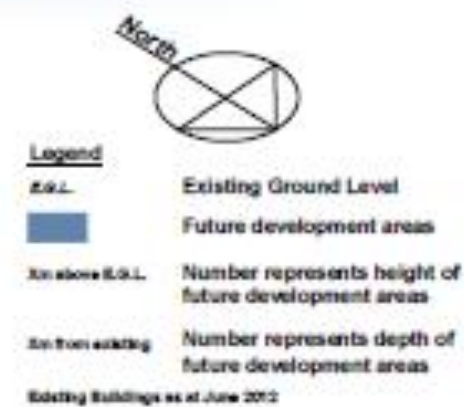
NORTH-EAST 3D IMAGE