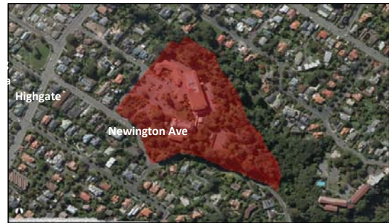
Figure 1 Location of the Mercy Hospital Site

The hospital was originally established in 1936 and relocated to the current Maori Hill site in 1969. The site is approximately 4.2ha in area (highlighted in Figure 1 ) and accommodates a complex of buildings which includes Mercy Hospital, Marinoto Clinic, Marinoto House and Mercy Care East. The Mercy Hospital complex is the only private surgical hospital in the City, providing specialist medical assessment, treatment and care services for its patients.