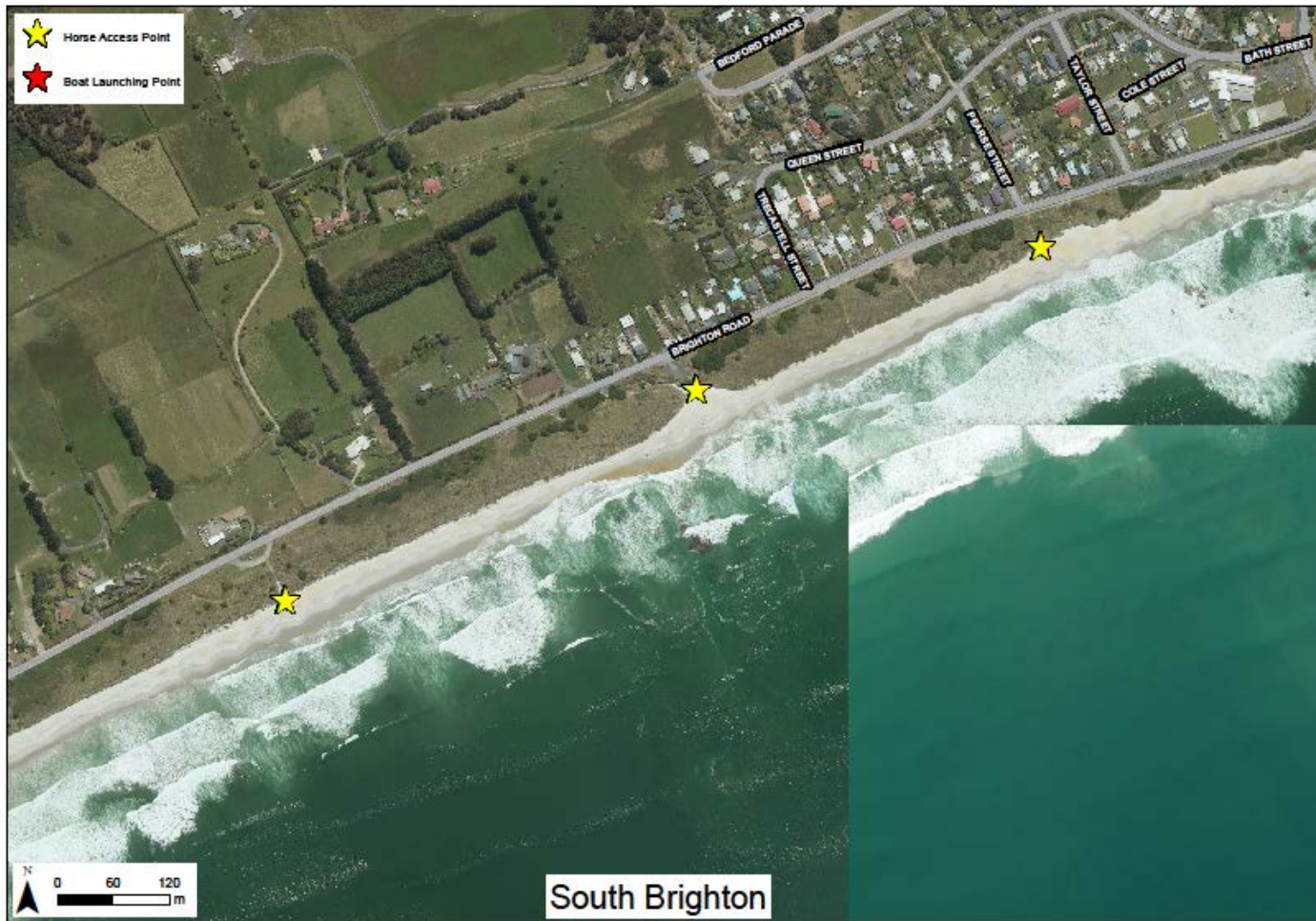
Table 6.1 - Brighton Beach