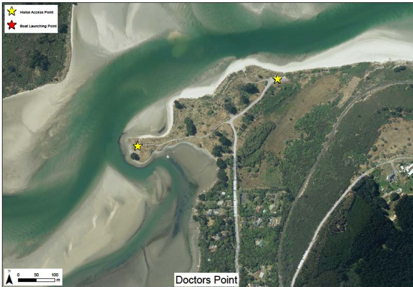
Table 7.1 - Doctors Point