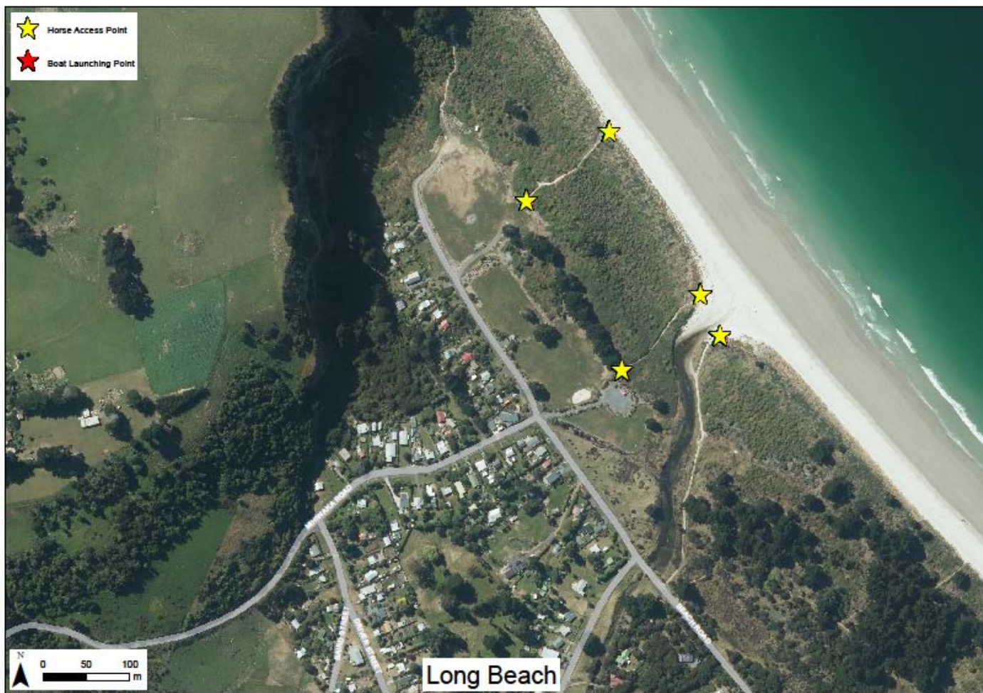
Table 7.2 - Long Beach