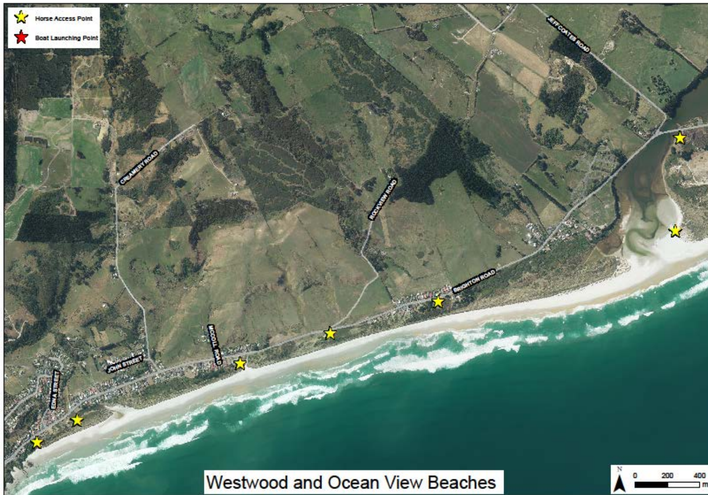
Table 5 – Westwood and Ocean View Beaches