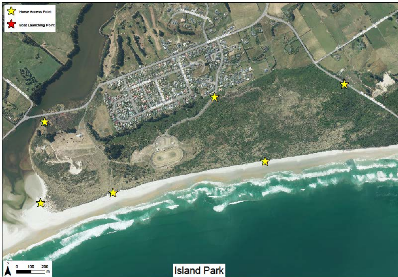
Table 3 - Island Park Recreation Reserve