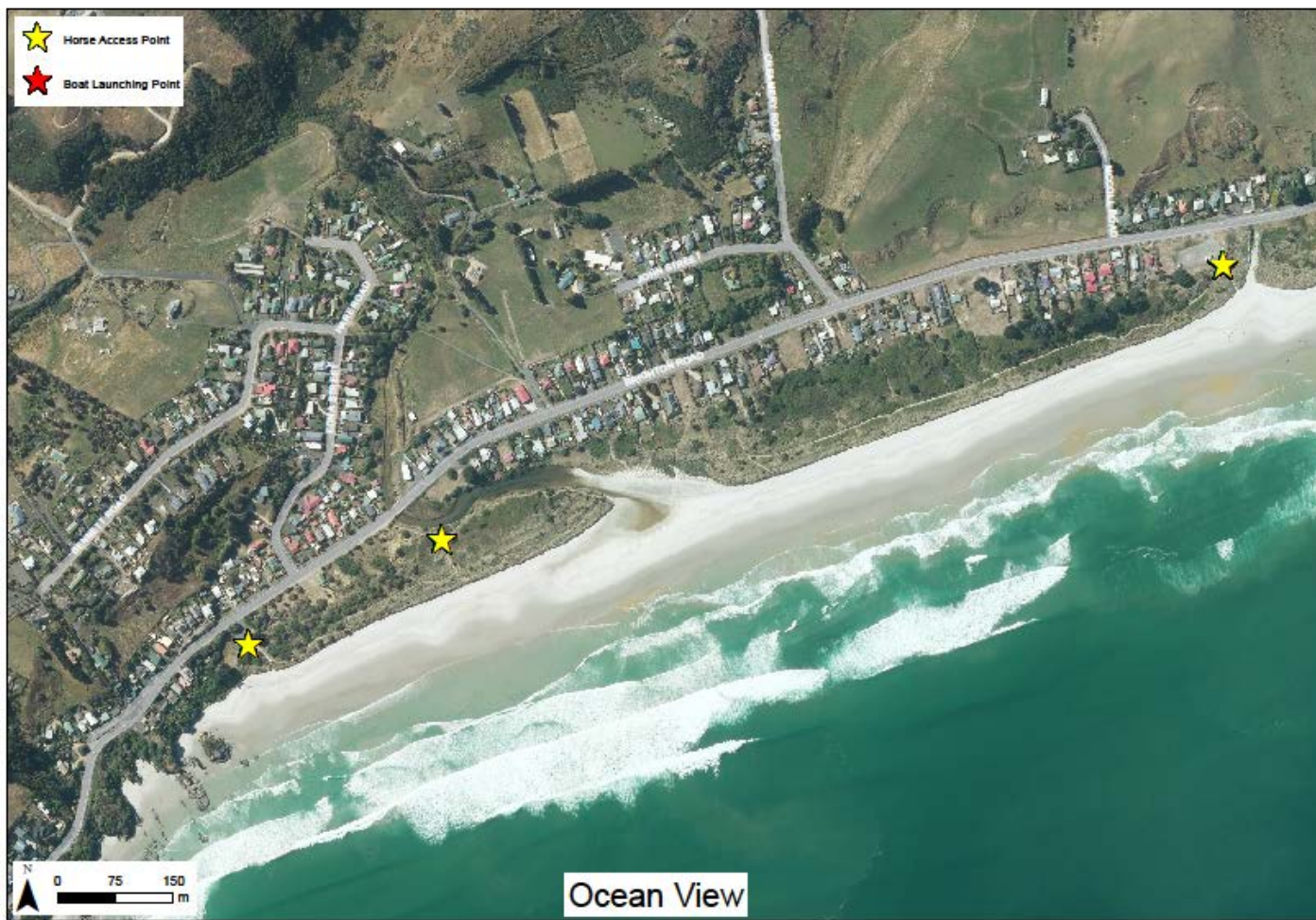
Table 4 - Ocean View Recreation Beach