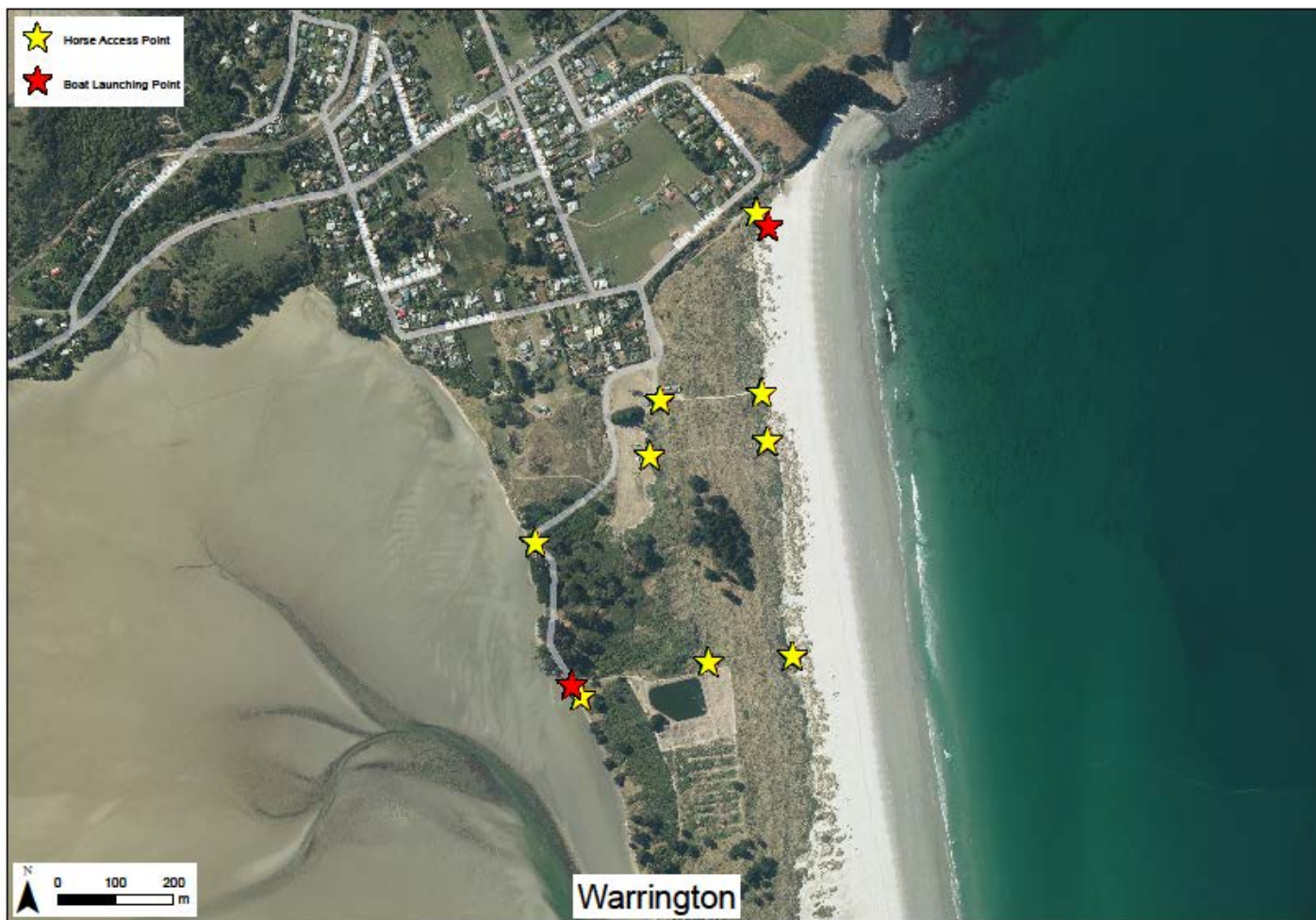
Table 8 - Warrington Beach