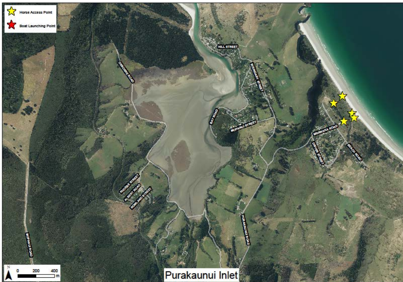
Table 7.3 – Purakaunui Inlet