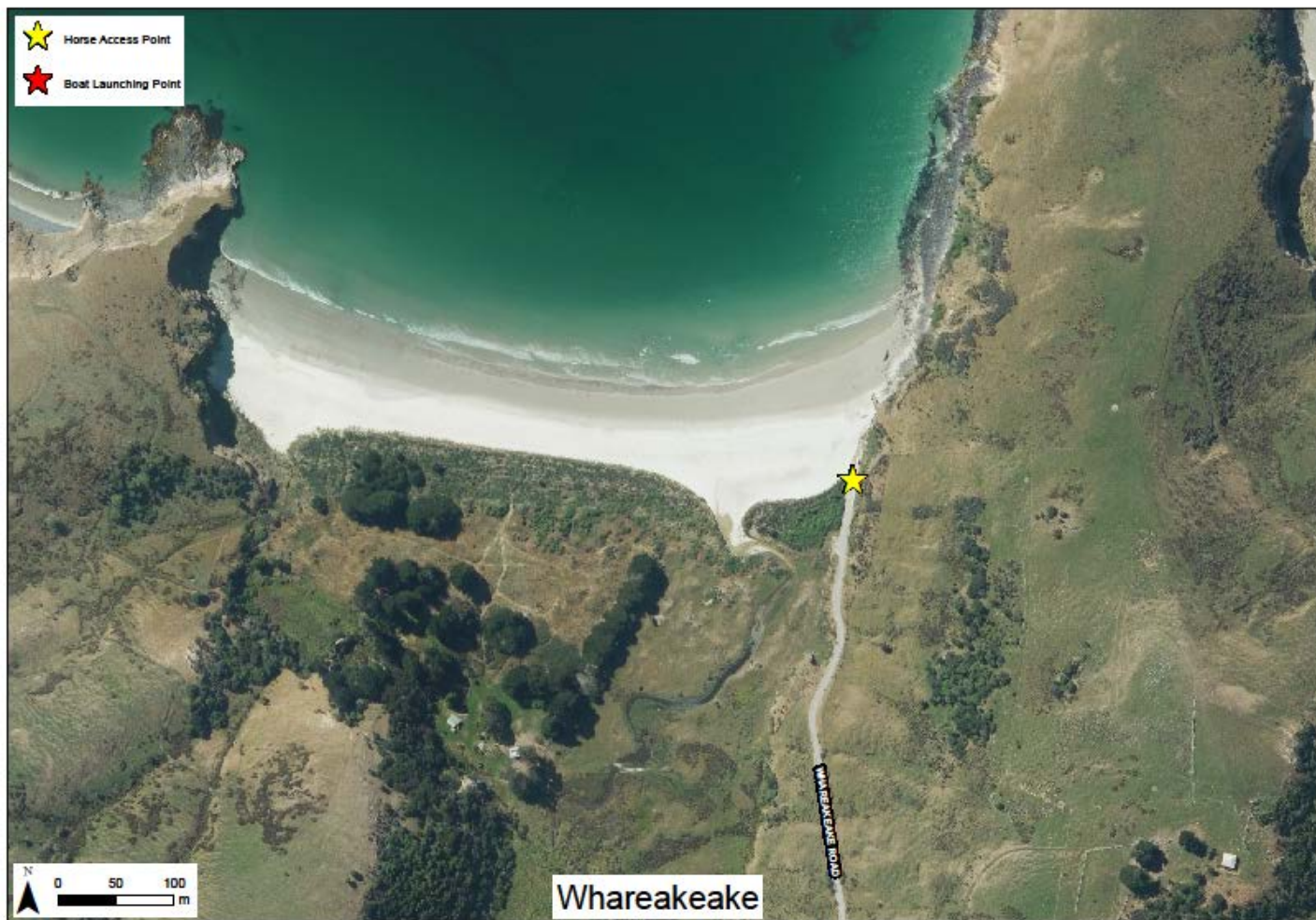
Table 9 – Whareakeake Beach (Murdering Beach)