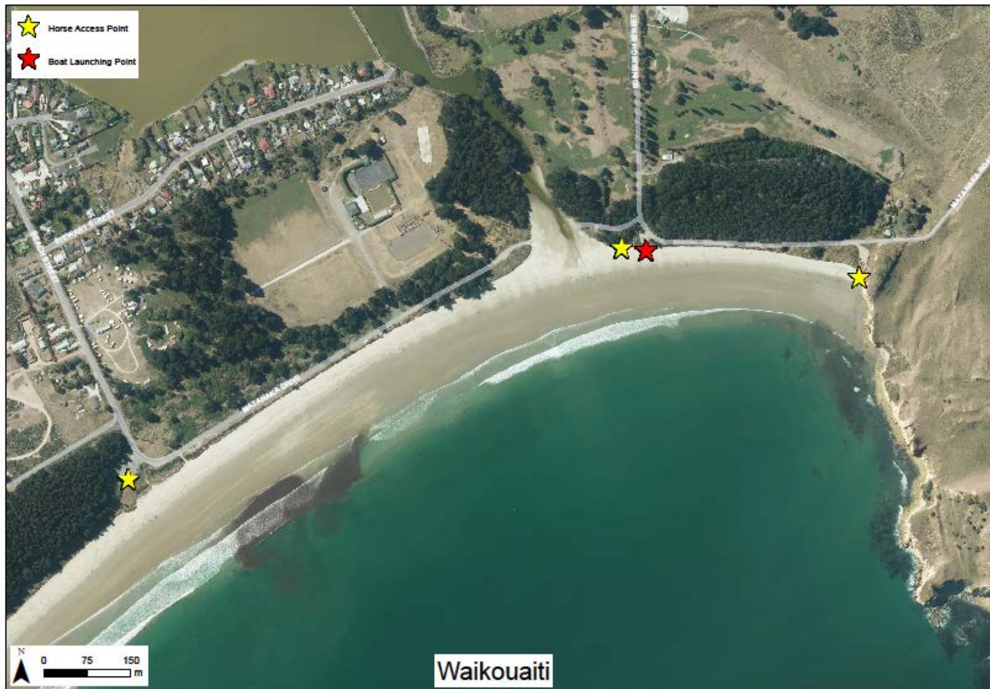
Table 2 - Waikouaiti Beach