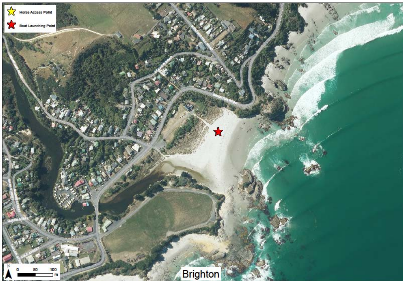
Table 6.2 - Brighton