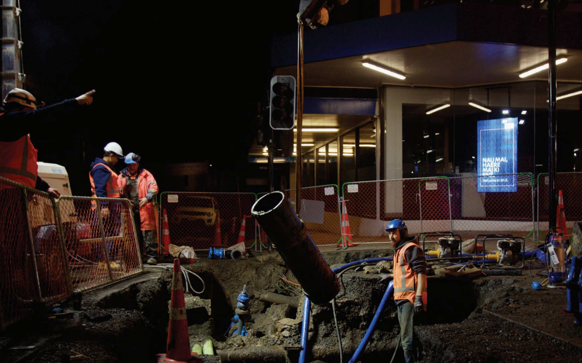
CONSTRUCTION WORK - Farmers block