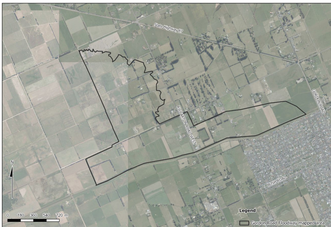
Figure 1: Gordon Road Floodway mapped area