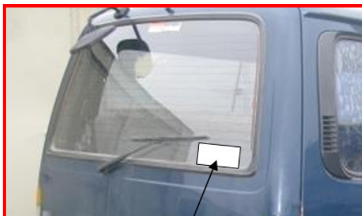
Car / Station wagon / Van / Ute