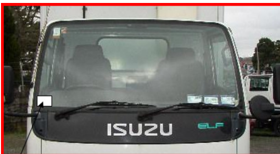
Truck - no side window